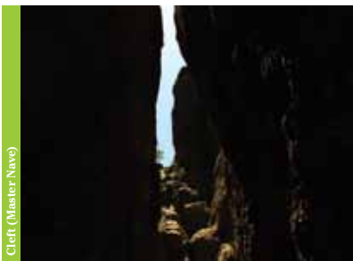
Cleft (Master Nave)

The Coal Route tells a part of the history of Manteigas, closely related to grazing, rye and forest. In the area with the higher altitude of the course, beside the use of the natural pastures for the cattle, that is still grazed nowadays, the coal was produced through the burning of heather root, for sale in the village of Manteigas, popularly designed by ember.